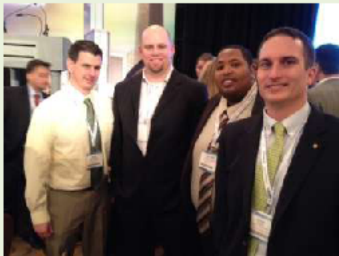
Leadership U participants at the Chicago Winter meeting.